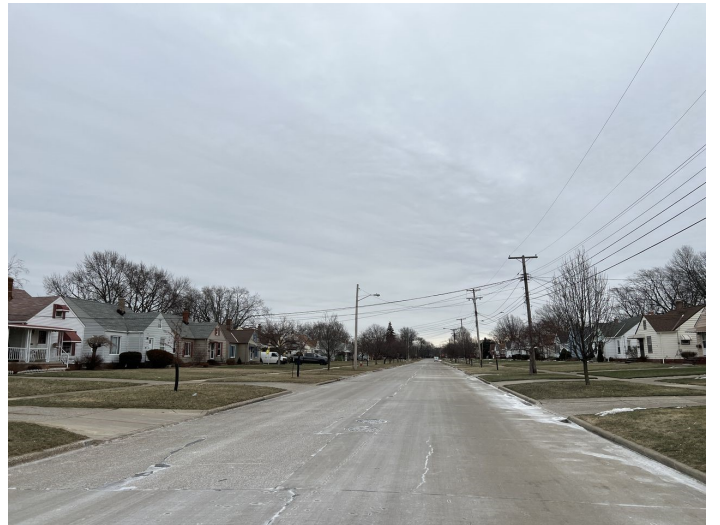
Archmere Avenue

Click here to read more about the project.