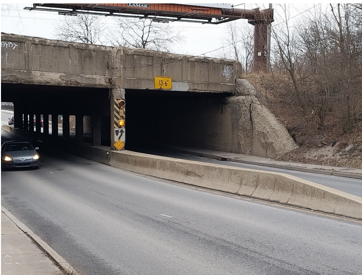
Memphis Avenue Railroad Bridge