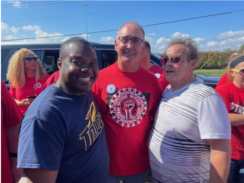
Supporting our workers with UAW President, Shawn Fain