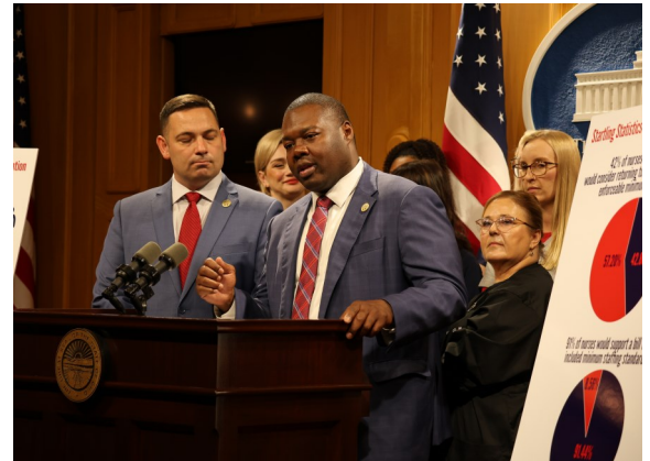
Introducing the Workforce and Safe Patient Care Act