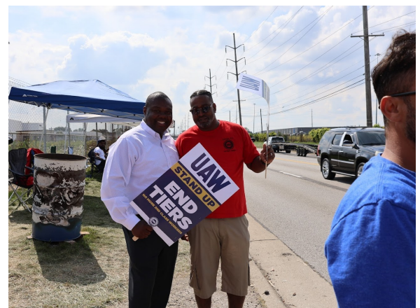
On the UAW picket line

If you have an upcoming event that our office should be aware of, please send us an email at rep44@ohiohouse.gov .