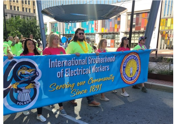
Northwest Ohio Labor Day Parade

Congratulations to the Pepsi plant on Hill avenue. They are gearing up for renovation and expansion. The plant is preparing to again increase its production which will bring more jobs and opportunities for women and men in the region.