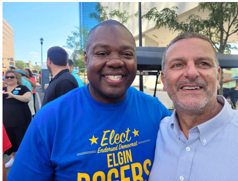
Northwest Ohio Labor Day Parade