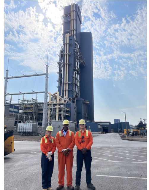
Surveying Cleveland-Cliffs Direct Reduction Facility, the only producer of hot-briquetted iron in the Great Lakes Region.