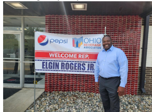
Pepsi's Toledo Production Facility is preparing for expansion. This will be great for our region's continued economic growth.