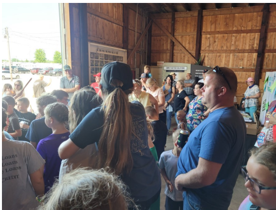
Supporting the youth at the Ottawa County Fair's "I want to be a farmer but I don't have a tractor" event