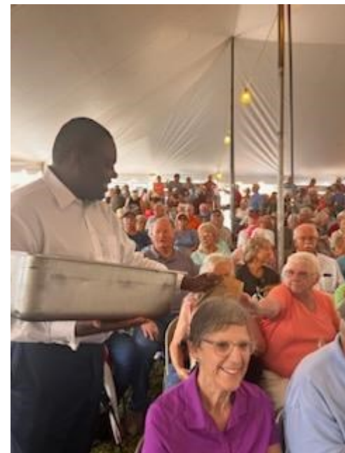
Serving lunch to seniors with the Wood County Committee on Aging