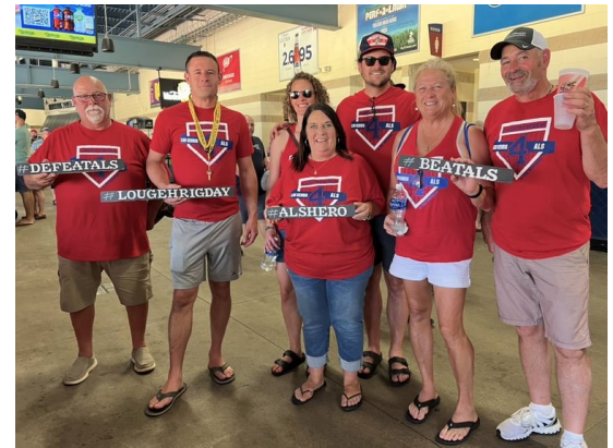
ALS Association Serving Northern Ohio's Lou Gehrig Day Event