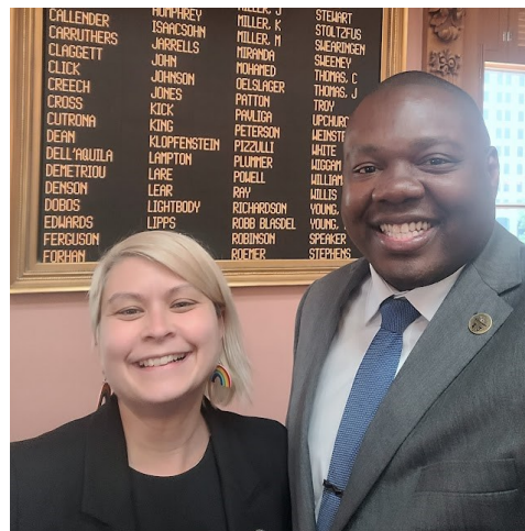
Supporting colleagues on first floor speeches