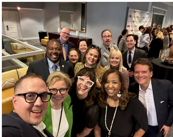
The northwest Ohio arts community was well represented at the Governor's Awards for the Arts.